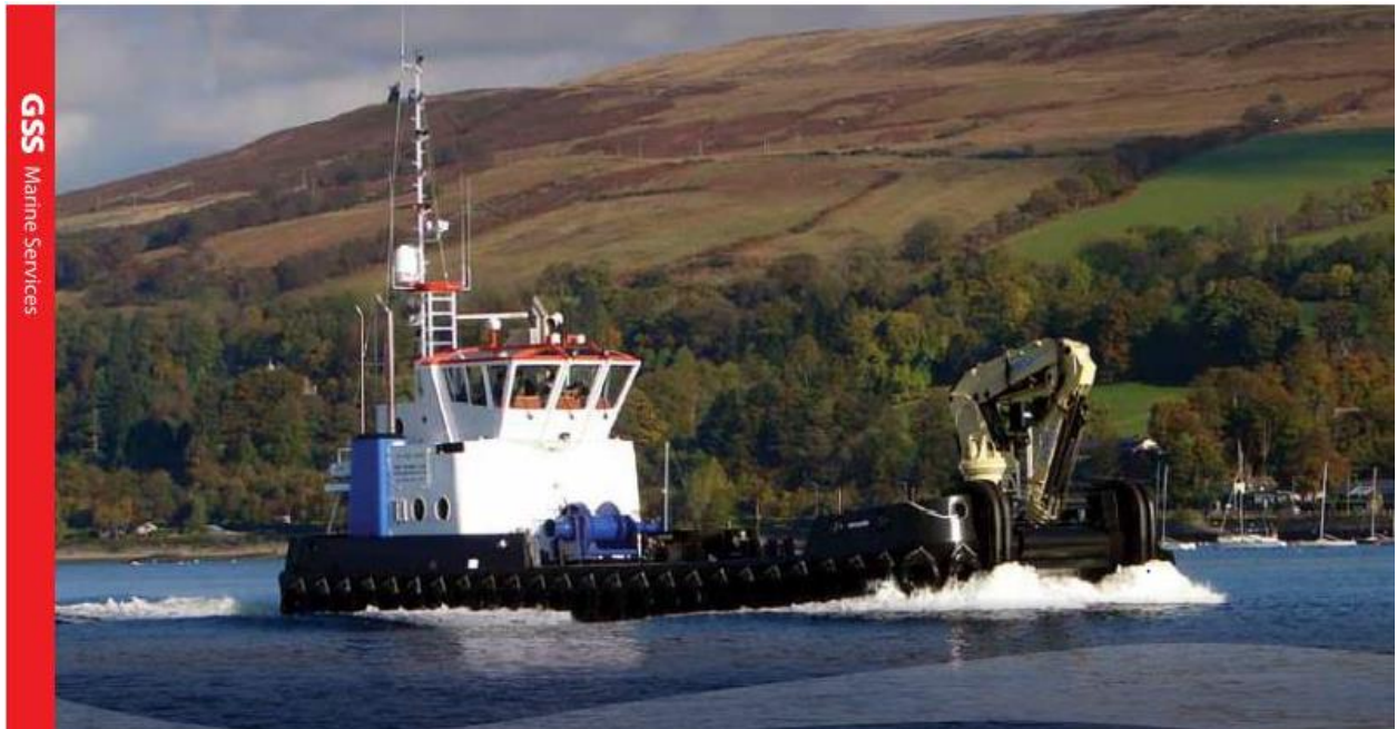
MEGAN M Call sign 2AGCS MMSI 235059319

Whilst there is temporarily spoil on the seabed the Guard Vessel Megan M will be on site contactable on VHF Channel 16 and VHF Channel 8.