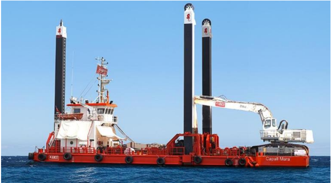
CAPALL MARA Call Sign MBSF3

The works will be undertaken by the Capall Mara and commence 25 th June 2018 the vessel will leave circa July 2018 with spoil being present for approximately two to three months.